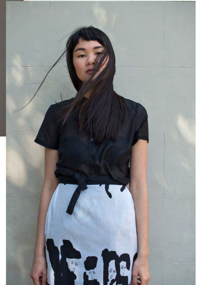
SWEET ABANDON BLOUSE MISTY MORNING SKIRT