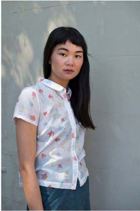
SWEET ABANDON BLOUSE