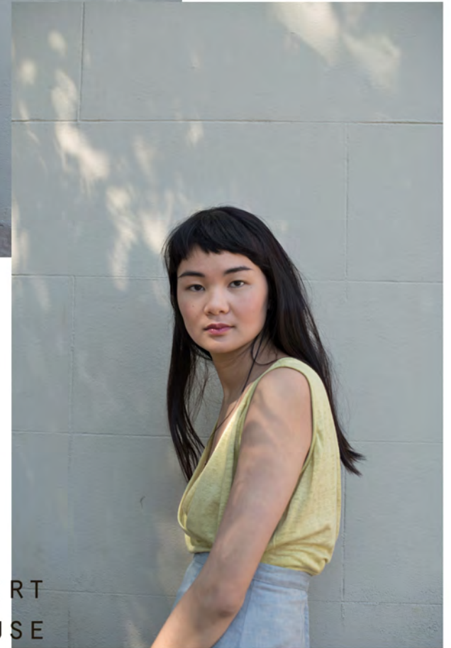
RUNNING FREE SKIRT STARRY DOME BLOUSE